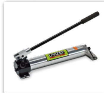
Aluminium Hand Pump 2800 bar, WA21028.