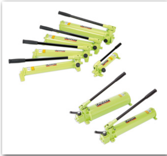
Hydraulic Steel Hand Pumps W-Series and X-Series.